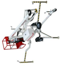
Axle on piece